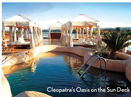
Cleopatra's Oasis on the Sun Deck