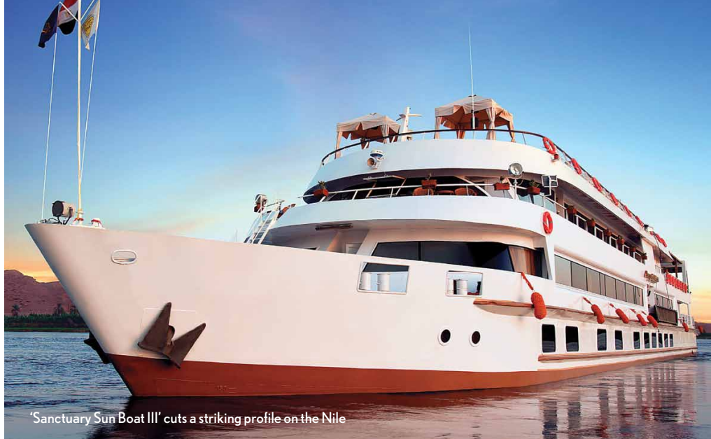
'Sanctuary Sun Boat III' cuts a striking profile on the Nile

Throughout your cruise, enjoy impeccable onboard service, top-notch amenities and lively onboard lectures. Combined with shore visits led by Egypt's finest guides, it is hardly surprising that Architectural Digest dubbed 'Sanctuary Sun Boat III' the "Jewel of the Nile."