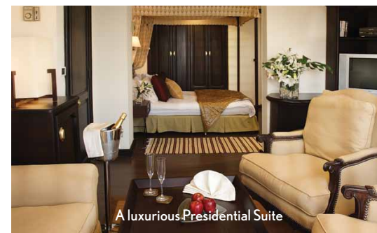
A luxurious Presidential Suite